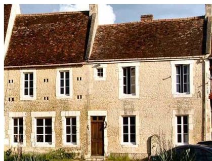
The Farmhouse, Coeur de Combray

We will be staying in the farmhouse at Coeur de Combray. Restored in 1994, the Farmhouse sleeps up to 8 people in four