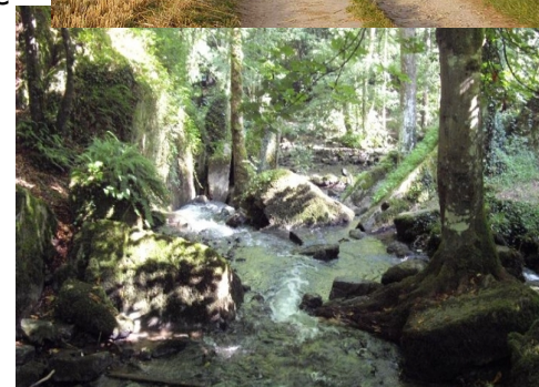
La brèche au diable