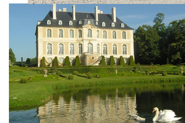
Château de Vendevre