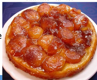
Tarte Tatin (apple flan)