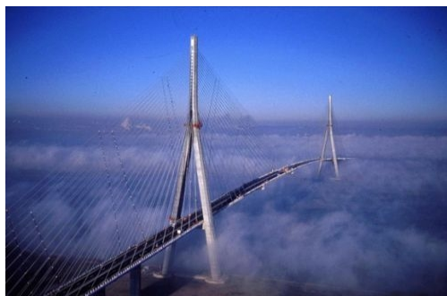
Pont de Normandie

This is a self-catering break. Crossing the river Seine by the amazing Pont de Normandie, we will make a bee-line to the Friday market in Deauville to stock up on everything we need for the weekend, so bring your euros!