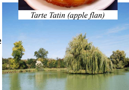
The lake at Combray